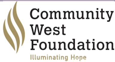
Community West Foundation - Bobst Family Fund Grant