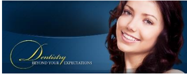
Betor Cosmetic Dental Group