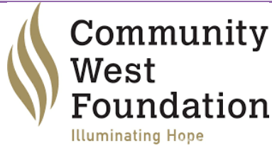
Community West Foundation - Bobst Family Fund Grant