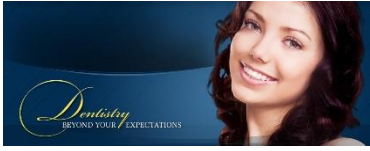
Betor Cosmetic Dental Group