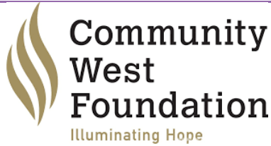
Community West Foundation - Bobst Family Fund Grant